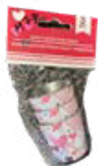
Valentines Day candy pails purchased at Dollar Tree

Contain lead (96 parts per million of lead in its accessible components)