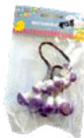
Easter-themed mini foam mushrooms purchased at Dollar Tree