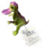
Dino Buddy toy purchased at Dollar General