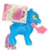
Pony toy purchased at Dollar Tree

In 2021, Dollar Tree committed to “eliminate the use of PVC in all private-brand children’s products” by 2024. 55 But private-brand products are not clearly marked - so shoppers have no way of knowing whether the toys they pick up at the store are PVC-free or not . And while Dollar Tree “encourages” its “national brand suppliers” to find safer alternatives to PVC, our testing suggests that PVC toys can readily be found on Dollar Tree shelves.