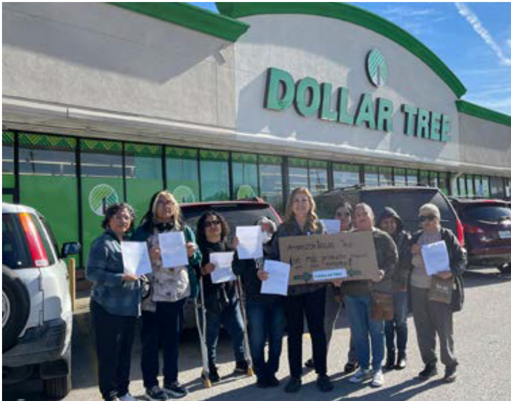
Texas Environmental Justice Advocacy Services (TEJAS) Participating in CHS' 2024 National Week of Action

Communities of color and low-income residents living near PVC manufacturing plants are regularly exposed to toxic chemicals from air emissions, and also face elevated risks from chemical disasters, including leaks, fires and explosions. 56 Numerous other highly hazardous chemicals are used or released during the production, use, and disposal of PVC plastic, including chlorine gas, asbestos, mercury, ethylene dichloride, phthalates, bisphenol A (BPA), organotins, heavy metals, chlorinated paraffins, dioxins and furans, and numerous other additives and chlorinated byproducts. 57 The community in Pasadena, TX is one example.