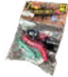
Critter Creatures plastic figures purchased at Dollar General