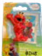
Elmo figurine purchased at Dollar Tree