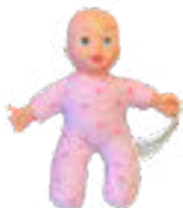
Baby doll purchased at Dollar Tree

Made with PVC Contains antimony (210 ppm)