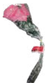
Bouquet of plastic flowers, purchased at Dollar Tree

Lead was found in a range of holiday decorations purchased at dollar stores, including plastic roses, Easter decorations and Valentine's Day candy pails.