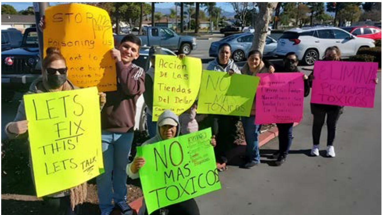
Líderes Campesinas participating in CHS' National Week of Action

Líderes Campesinas is a statewide network of farmworker women and youth, based in 18 farm working communities throughout California, organizing to create healthier working conditions, safer environments, and engaged women leaders. In spring 2024, organizers with Líderes Campesinas mobilized to purchase dollar store products for testing, held direct actions outside of dollar stores, and also surveyed 243 members of their community to ask whether they shopped regularly at dollar stores, what they bought, and if they considered dollar store products to be safe.